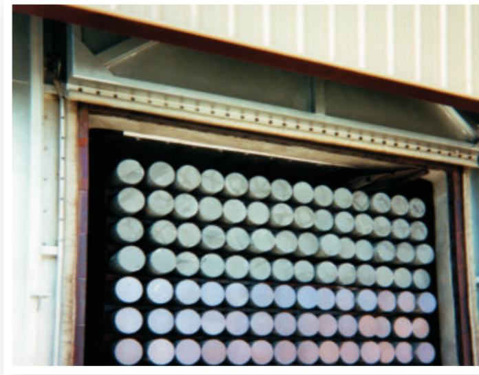
Movable baffle (lowered position)