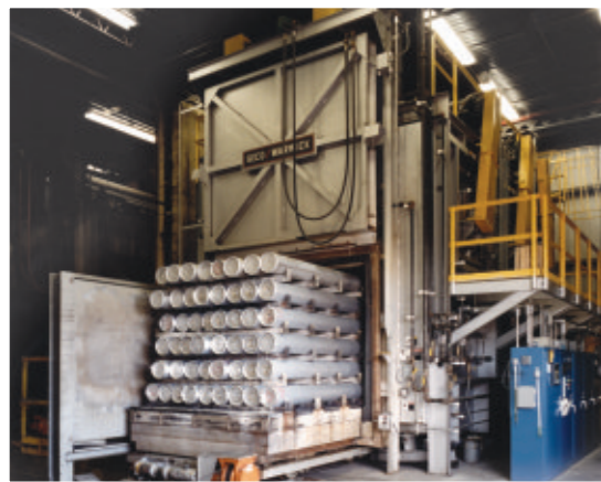
Batch style furnace with car

Cooling Systems Cooling after homogenization can add significant value to the logs or billets. Production requirements are requiring faster, more uniform cooling of the logs or billets. Evidence increasingly shows that the resulting grain structure and workability properties of the billets are a result of the cooling medium to be used after homogenization. While fast cooling is desirable, it must also be uniform throughout the load space or significant bowing of the logs could occur. For batch type loads using a car or tray, SECO/WARWICK offers a variety of load cooler designs such as one-way airflow, reversing airflow, air/mist arrangements, etc., depending on the level of performance required. These chambers are designed to cool the load uniformly to your specifications. Loads are usually plunge cooled at rates that can approach 700°F/hr in the initial stages of the cycle. The cooling rate can also be controlled using variable speed cooling fans.