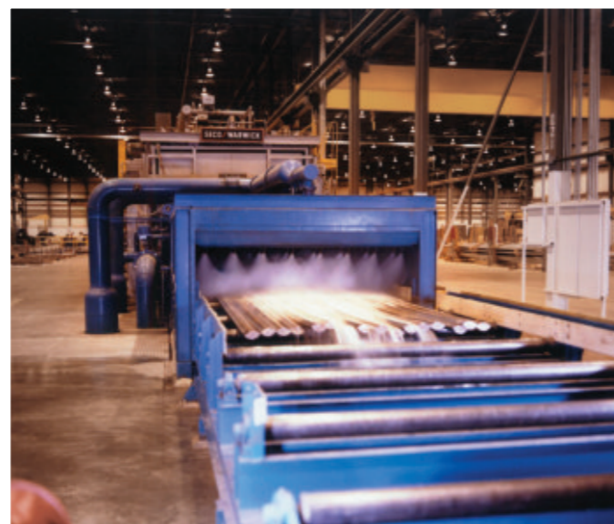
Solution Heat Treat Furnace with Spray Quenching for aluminum extrusions