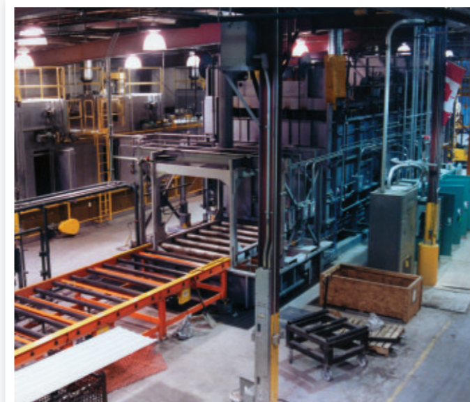
Solution heat treat furnace and age oven system for aluminum differential carrier castings