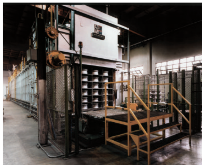
Fully automated solution heat treat and aging system for automotive wheels

SECO/WARWICK builds solution heat treating furnace systems for aluminium castings, aluminium plate, aluminium forgings, aluminium extrusions, aircraft applications and billet preheating. With our experience and turnkey capabilities, we will continue to be a world leader and innovative manufacturer of solution heat treating furnace systems. SECO/WARWICK is your complete supplier of heat treating and aging furnace systems.